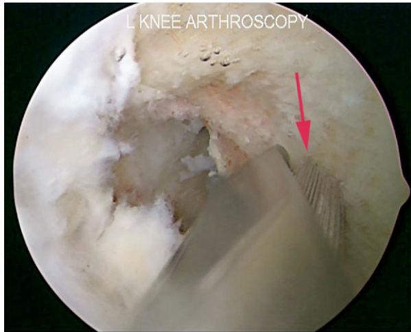
FIGURE 3. Arthroscopic anterolateral portal view of left (L) knee showing Beath pin (arrow) brought through TPG (at 2-o'clock position on lateral wall of femoral intercondylar notch via AM arthroscopic portal) and impacted into lateral wall of notch to mark centrum of ACL femoral socket.

In addition, at 90°, it is simple to slip the flutes of the reamer around and past the cartilage of the medial femoral condyle under direct arthroscopic visualization in an unconstrained manner, as well as