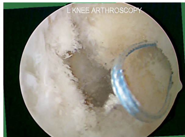
FIGURE 7. Arthroscopic anterolateral portal view of left (L) knee showing femoral graft-passing suture loop (blue) positioned in ACL femoral socket for later retrieval and graft passage. The socket was created on the lateral wall of the femoral intercondylar notch at the 2-o'clock position via the AM arthroscopic portal.

Because the socket is drilled in hyperflexion, hyperflexion thus aids passage of the graft and/or suspensory fixation buttons. For femoral interference screw fixation, hyperflexion guarantees absolutely