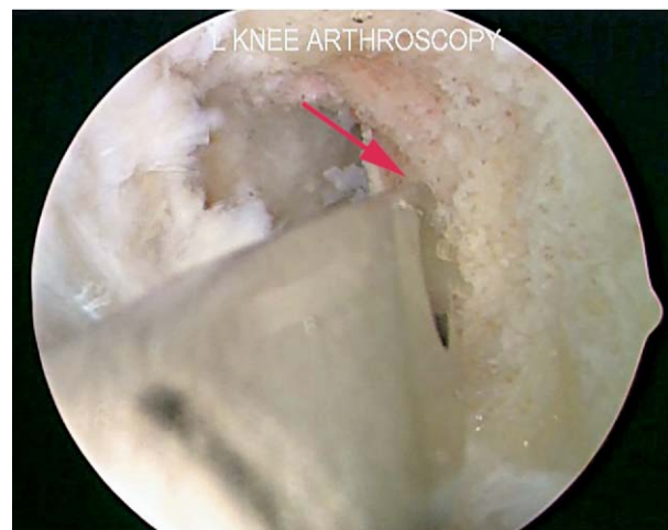
FIGURE 2. Arthroscopic anterolateral portal view of left (L) knee showing complete seating of TPG at 2-o’clock position on lateral wall of femoral intercondylar notch via AM arthroscopic portal. The arrow marks the angled offset tip.

Once the surgeon is satisfied with precise placement of the mark, the appropriate diameter acorn reamer is loaded on a Jacobs chuck, but not yet loaded on a power reamer. Rather, a Beath pin is then preloaded, within the reamer. Next, the composite (reamer preloaded with Beath pin) is placed via the AM portal in the familiar 90° flexion position. At 90° (as opposed to hyperflexion), the portal is not too tight, and fat pad ingress can be avoided.