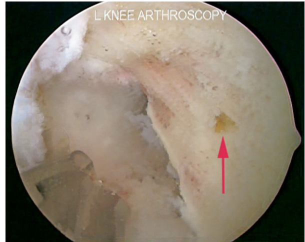
FIGURE 4. Arthroscopic anterolateral portal view of left (L) knee showing marked centrum (arrow) of ACL femoral socket on lateral wall of femoral intercondylar notch at 2-o'clock position.

to avoid iatrogenic cartilage damage, because the Beath pin has not yet been drilled into a constrained (transfemoral) position (Fig 5).