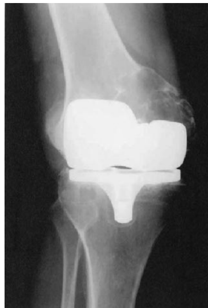
FIGURE 2. Radiographic appearance of polyethylene wear.

Polyethylene wear (Figs. 2, 3) accounted for 7% of revisions in Fehring et al's series 14 and, at 25%, was the leading cause of revision in Sharkey et al's series. 15 The average time to polyethylene failure was 7 years in the latter study compared with 41.4 months in the former study. This may account for the difference in the prevalence of this failure mechanism. Component design con-