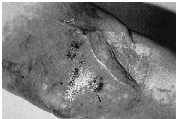
FIGURE 1. Infected total knee arthroplasty.