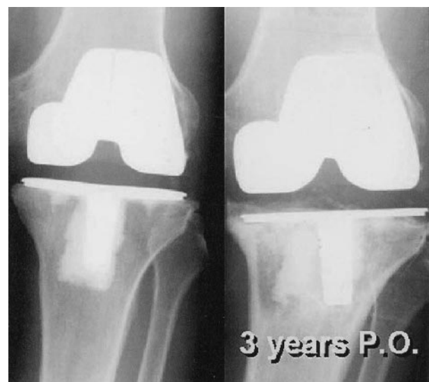
FIGURE 4. Radiographic appearance of aseptic loosening three years after the index procedure.

Extensor mechanism problems such as extensor lag and disruption can lead to revision. Furthermore, aseptic ne-